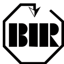
Badatz Igud Rabbonim