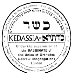
Kedassia of London