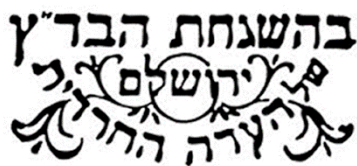
Eida Hachereidis Badatz of Yerushalayim

These are good on products from any place in the world that they have been packaged.