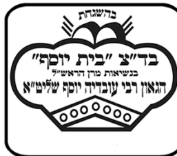
Bet Din Zedek Bet Yosef